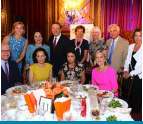
Women Breaking the Silence About Mental Illness